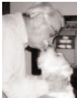
"Cookie" kissing a patient

enhances the quality of life for institutionalized individuals through a pet visitation program, which is based on animal assisted therapy. Therapy Pet Pals believes that the unconditional love of an animal is a significant factor in bringing joy to life and improving physical and mental health.