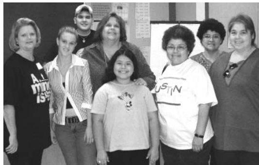
For the Love of Christi Volunteers

For the Love of Christi provides love, comfort, hope and ongoing support to those adjusting to life after the death of a loved one, regardless of the circum-